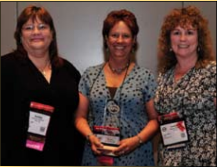
Greater Nashville Chapter wins Best Chapter Website Contest